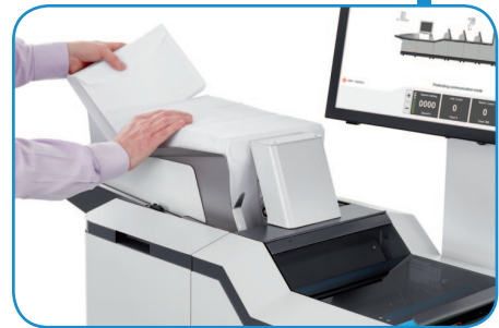
High-Capacity Envelope Feeder