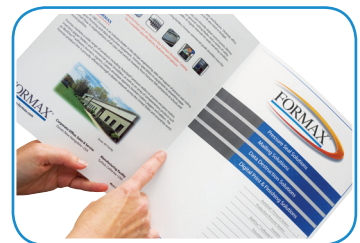
Sheet is creased and ready for crack-free folding