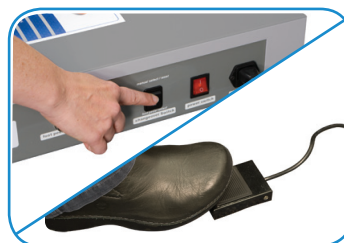
Choose either push-button or foot-pedal operation