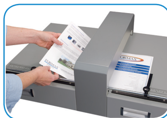
Load sheet to be creased