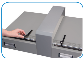
Adjust side guides