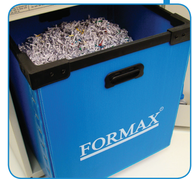
Lifetime Guaranteed Heavy-Duty Waste Bin