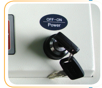
Keyed On/Off switch

The FD 8804SC offers unmatched automated features through its LED control panel. The easy-to-read Load Indicator assists operators in determining how close they are to the maximum shred capacity to avoid jams and provide optimal efficiency. Indicators also notify operators when the waste bin is full or the cabinet door is open. Operators can select from two modes of operation: Auto Start/Stop or Manual. Auto Start/Stop mode utilizes optical sensors which detect paper and start/stop operation automatically. Manual mode provides non-stop operation for shredding small sized paper or films.