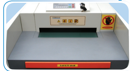
Large infeed deck with conveyor belt feed and safety bar for immediate shut down

Keeping the FD 8804SC in top condition is easy to do. With the Auto Cleaning function, clearing the blades of shredding debris is as simple as pressing Reverse on the control panel. Plus, the EvenFlow™ Automatic Oiling System lubricates the all-steel cutting blades, helping to keep the shredder in peak condition for optimal efficiency.