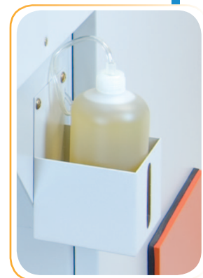
EvenFlow™ Oiling System Reservoir Bottle

Safety is an important component in the FD 8804SC design and engineering. A large 18"-wide safety bar is located in front of the conveyor belt system and will shut down the shredder instantly when pressed. A safety key and lock system is also included to ensure the shredder is operated only by authorized staff.